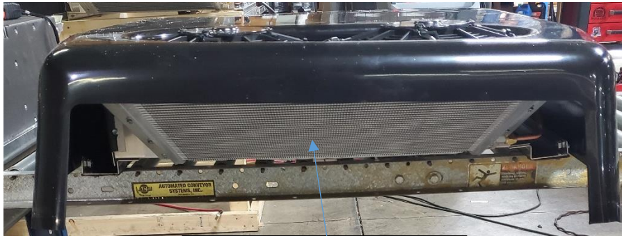
Condenser Coil View from Front of Vehicle

While driving down the road, over time, the condenser coil of your Turbo II can become partially clogged with dust, dirt, grease, and general road debris. Because of this it is necessary to periodically (once/yr) rinse out the coil with water. Important: Do not use high pressure water to clean the condenser coil. This can lead to damage of the aluminum fins on the coil which can lead to system failure. Use only normal water pressure from a typical garden hose. Simply rinsing off this dirt and debris will ensure maximum system performance.